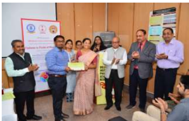
Certificate distribution in valedictory program