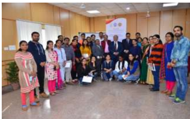
XXVIII QIP Program 11- 15 March 2019